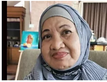
Kelantan hotels on last legs, urge gov't to lift inter-district travel ban | New Straits... New Straits Times