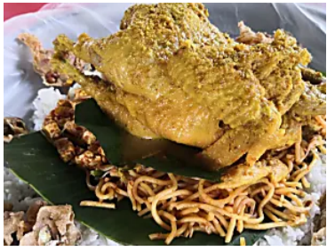
JOM! EAT: Royal nod, a local favourite | New Straits Times New Straits Times