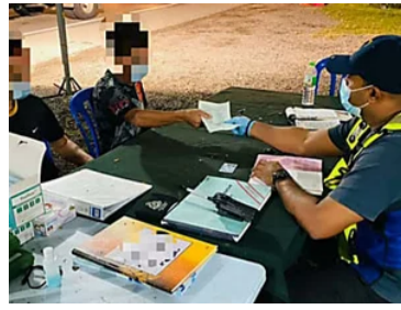
Costly balik kampung trip for two Kelantan-bound express bus passengers |... New Straits Times